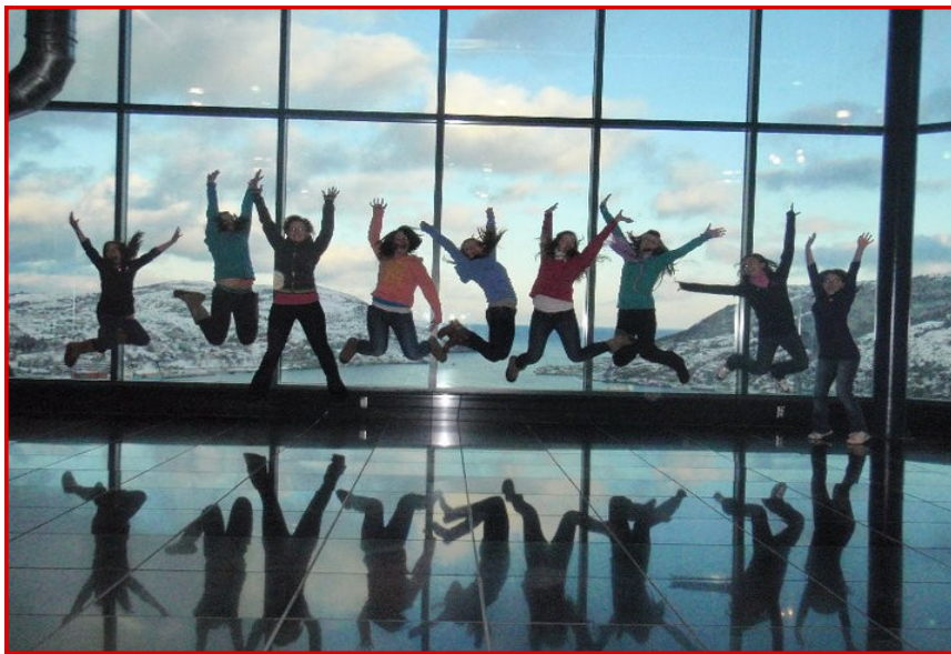
Sr Synchro Team takes on NFLD. Read about it on page 3